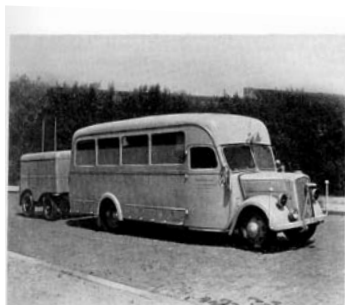
Mobile x-ray unit from the 1950s