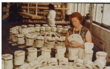
Preparing molds for casting